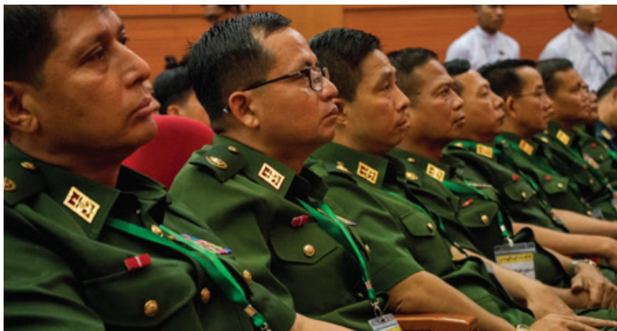
Tatmadaw delegates to the 21st Century Panglong Union Peace Conference listen to the opening speeches on July 11.

The opaque selection process, lack of pluralism in membership, the unwillingness to investigate major abuses by the Myanmar Military, and the backgrounds of the Commissioners, including two former military personnel, are major factors in the trust deficit among the public and civil society, despite the improved efforts taken by the MNHRC to engage with civil society. Many of the Commissioners lack previous experience in human rights work, and their commitment to the universality of human rights is questionable. The terms of the current Commissioners end in 2019, and this gives the current National League for Democracy (NLD)-led Government an opportunity to amend the MNHRC Law, especially to make the Selection Board more inclusive and independent, and thus ensure a more transparent and open selection process for a more effective, representative and action-orientated MNHRC.