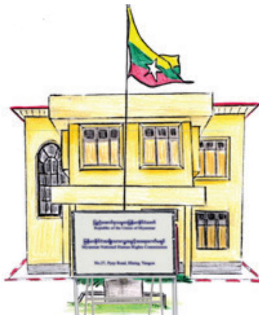
The Myanmar National Human Rights Commission, Yangon.

In practice, the selection process has been lacking transparency. A reshuffle in September 2014 resulted in the number of Commissioners being reduced from 15 to 11 and seven members being replaced. 26 These changes were made subsequent to the passing of the MNHRC Law earlier in the year and resulted in a replacement of the Commissioners that had been in place when the MNHRC's mandate was established by Presidential Decree in 2011. Significantly, none of the members who were replaced were aware of the process and one even questioned the legality of the reshuffle. 27 There was no clear indication regarding whether or not the Selection Board had been convened to appoint new Commissioners or if it had been instituted in a top-down process by then-President Thein Sein, or by another authority. This lack of transparency was also apparent in the recent appointment of three new Commissioners which was announced through a short statement on the Facebook page of the President's Office with no details regarding the selection process. 28 This contradicts the explicit stipulation in the General Observation that there must be "a clear, transparent, merit-based and participatory selection and appointment process". 29