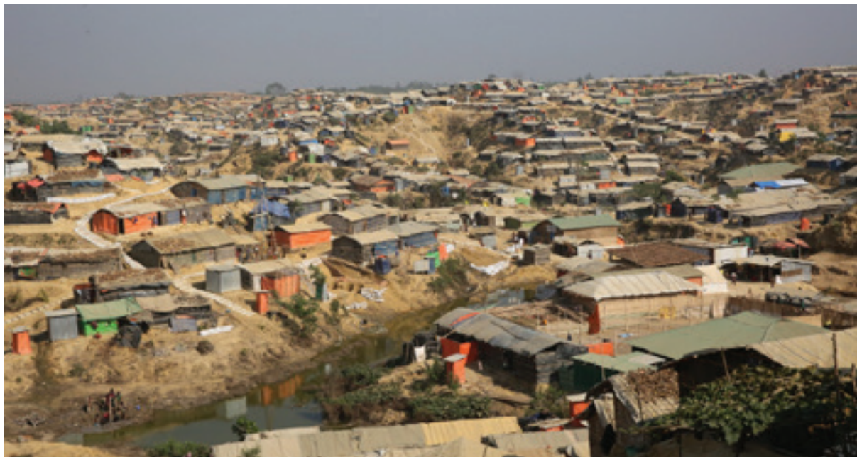
The Rohingyas are living in these rickety huts made of bamboo and plastic sheets in the Cox’s Bazar refugee camps.

the situation of human rights in Myanmar. 12 Given the credible evidence of crimes against humanity that has been well documented by the UN and international and local human rights organisations, the failure of the MNHRC to even recognise the term Rohingya is shocking. 13 After a visit to the affected area, the MNHRC released a statement, using the word ‘Bangali’ throughout, focusing on the acts of the ‘terrorist’ group, the Arakan Rohingya Salvation Army, not once mentioning the horrific crimes committed by the Myanmar Military, and even recommending more security posts to be established in the area. 14 The GANHRI-SCA report “encourages the NHRC to interpret its mandate in a broad, liberal and purposive manner, and to promote and protect human rights of all including the rights of Rohingya and other minority groups”. 15 Given the MNHRC’s demonstrated refusal to recognise the term, ‘Rohingya’ and thus their right to self-identify, this is very unlikely.