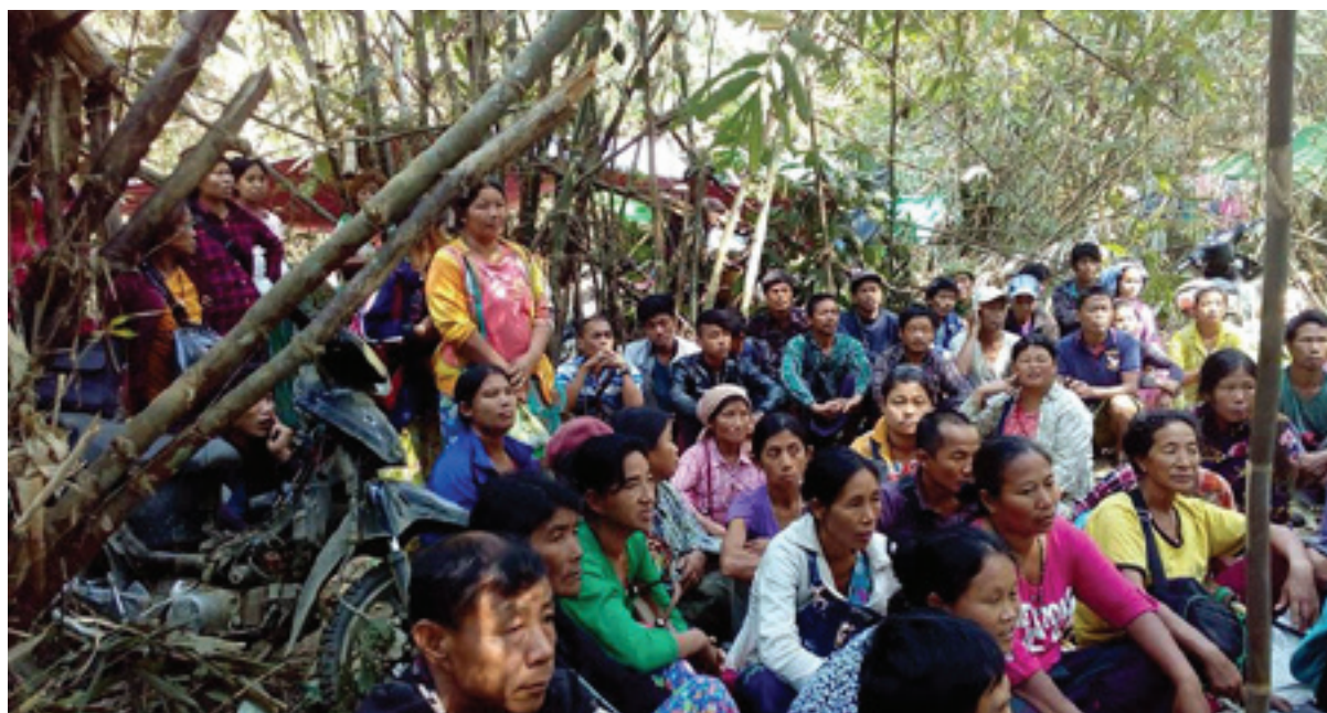
IDPs from Awng Lawt fleeing in the jungle.

Instead of making substantive efforts in human rights protection, recommendations towards which were made in the 2017 ANNI report, the MNHRC has focused its activities on human rights promotion and education with the Chairperson believing that “education is the best way towards peace” as it is “more sustainable than any type of ceasefire”. 16 Many trainings and workshops have been given by the MNHRC, including to the General Administration Department, government officials, department heads, and trainees at military training centres. While this long-term strategy is encouraged, this must go hand-in-hand with - and not at the expense of - more robust human rights protection in the short term. Furthermore, given the continued severity of human rights violations committed by the Myanmar Military, it is questionable how effective such a strategy has been thus far.