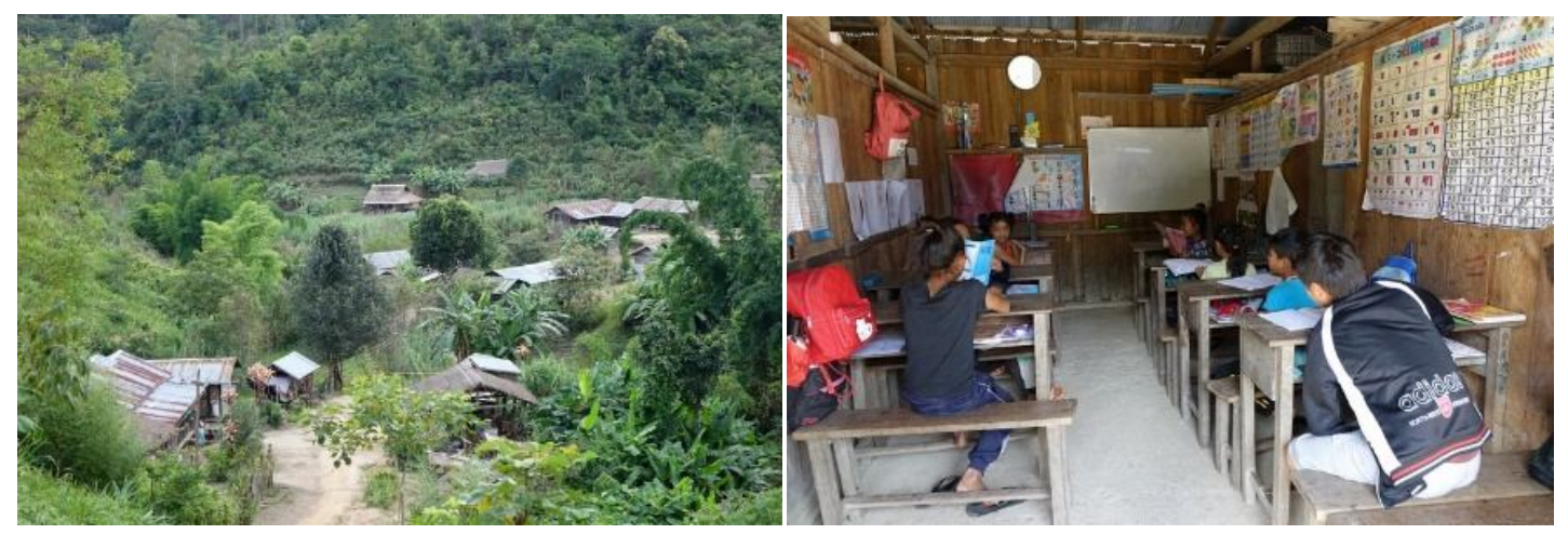
Loi Lam IDP camp