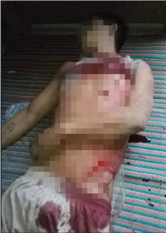
Photo: 21-year-old man killed by Burma army shelling

On 27 January the Burma army used two military jets to drop bombs on a KIA-controlled village in Tanai Township, Kachin State. One civilian was killed and two were injured. Several homes were also destroyed. Some 500 people fled the attack while others were blocked from escaping by Burma army soldiers. Those fleeing faced abuse from soldiers at checkpoints.