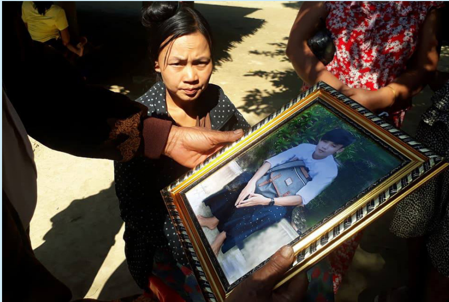
Photo: An 18-year-old Arakanese man shot to death by police during a protest in Mrauk-U | Credit: AASYC