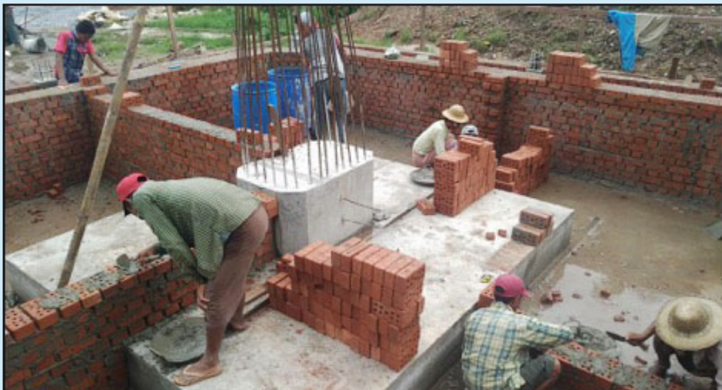
Photo: A new memorial commemorating the 8888 uprising is being built in Bago

The reporting period saw no meaningful government action on reparations for victims of human rights violations. Domestic civil society instead continues to provide assistance to victims. In February a healthcare centre offering free treatment for former political prisoners opened in Rangoon. It is run by activists