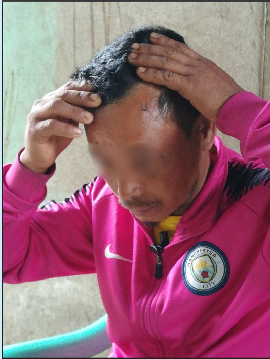
Photo: A 41-year-old Kachin man who was tortured by Burma army soldiers in Tanai Township

soldiers accused him of supporting the KIA through providing them with food supplies. The interviewee told them that KIA soldiers sometimes came to his house as he lived in the forest. The men were shackled overnight and denied food and water.