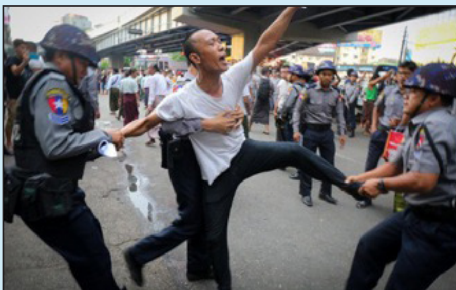
Photo: Police restrain a protester in Rangoon on 15 May 2018

The right to protest was severely restricted over the reporting period. In January, a police crackdown on a protest of some 4,000 people in Arakan State led to death of seven people, with a further 12 being injured (Case 15). The demonstrators were protesting a local government decision to withhold permission for an annual event commemorating the fall of the Arakan kingdom in the 18th Century.