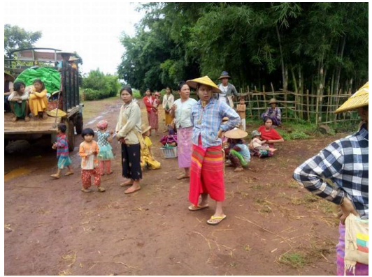
Villagers fleeing from Loi Yoi

On September 11, 2017 about 30 Burma Army troops from IB 147, based in Nawng Kaw, Khai Hsim, were coming from the direction of Hsawng Ke to the deserted village of Wan Kao Koong Mued in Hsipaw township, when they began shelling and shooting around the village, instilling fear among nearby villagers.