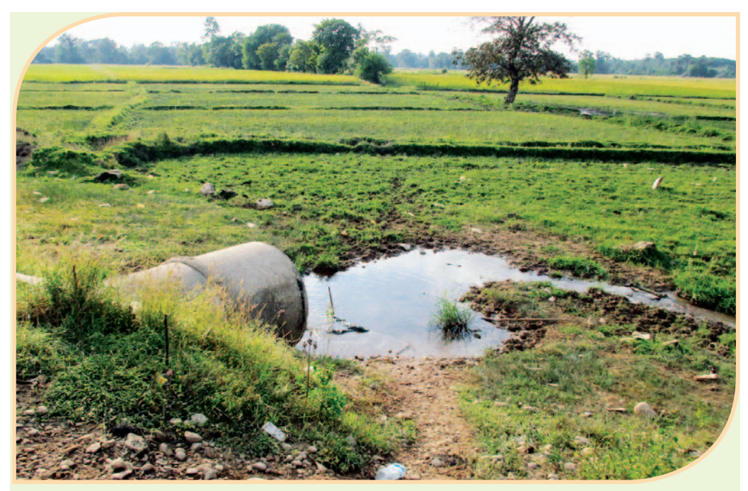
This photo was taken on 24th October 2015 beside the Asian Highway in Kawkareik Township. The photo shows the pipe that was built to allow runn-off water from the road to flow into the paddy field.