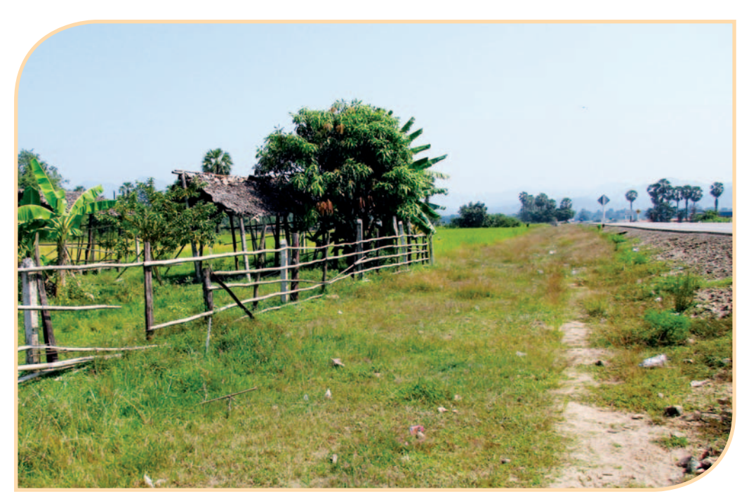
This road will be expanded by 35 meters on each side into existing farmland, and villagers have been told that these areas are slated for road construction and will not be eligible for any compensation.

A major concern is that the Myanmar Ministry of Construction (MoC) and its approved contractor, the China Road and Bridge Construction Co. Ltd, will be carrying out the Project. Experience from the past has shown that Government agencies in Myanmar are corrupt and ineffective.<sup>28</sup> Past projects carried out by the MoC in Karen State have utterly failed to safeguard the rights of affected communities, most recently in the new Asian Highway alignment section financed by NEDA. The ADB claims it can ensure that the safeguard policies are followed, but however the evident reality is that they are too disconnected from what is really happening on the ground in Karen State, and have no way to hold the MoC accountable if it fails to follow the guidelines.