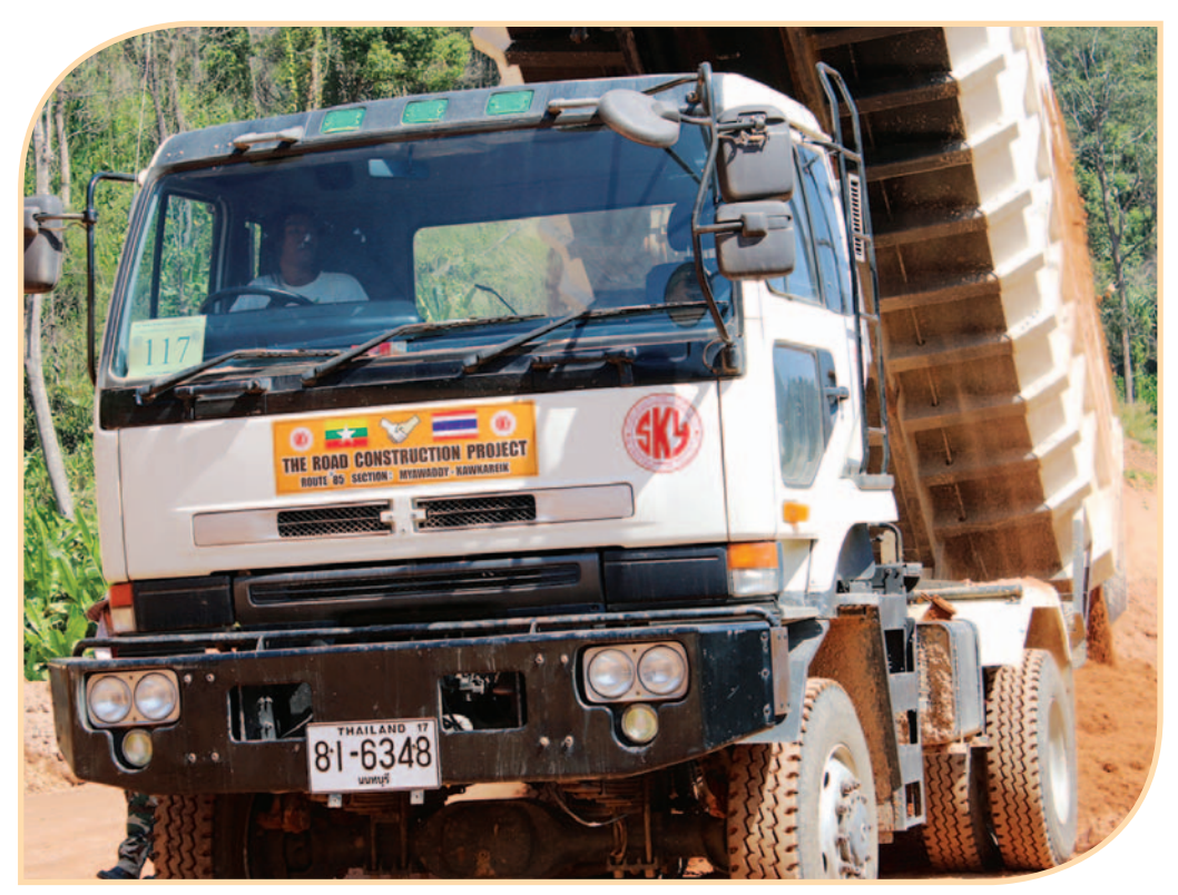
Construction truck on the Asia Highway road link from Thin Gan Nyi Naung to Kawkareik

Despite these warnings and the potential negative impacts the Project could have on the ongoing peace process, the MoC did not establish an independent advisory panel and there is no indication that a thorough conflict impact assessment on the ongoing peace process has been or will be conducted. Recent history has shown what can be expected if the Project continues without properly taking the peace process into account: increased militarization, unrelenting conflict, and repeated casualties suffered by innocent villagers and bystanders. Development can complement peace, but the two must work hand-in-hand in order to do so. As it currently stands, the Resettlement Plan prioritizes development at the expense of peace.