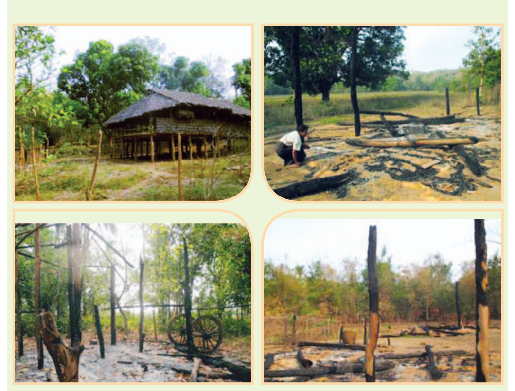
The photos were taken by a KHRG-affiliated community member in March 2016 in Tha Nay Moo village, Kawkareik Township.

After fighting had ceased, Myanmar Army and BGF soldiers asked villagers to return to their village, but they simply did not have the means to rebuild their houses. None of the villagers dared to return to their village until March 2016, but even then, they still had to fear leftover landmines scattered in nearby areas. Myanmar Army soldiers continue to pass through Tha Nay Moo village every day, making it difficult for villagers to recover a sense of normalcy in their daily lives.