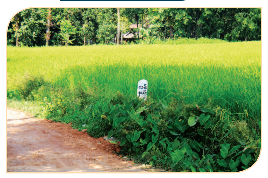
This photo was taken on 24th October 2015 showing the post marker stating "Right of Way", which the government uses to demarcate road boundaries. The villagers have to dismantle their houses and shops if they are located within the road boundaries.

U Hla (pseudonym) from Chaung Taung village