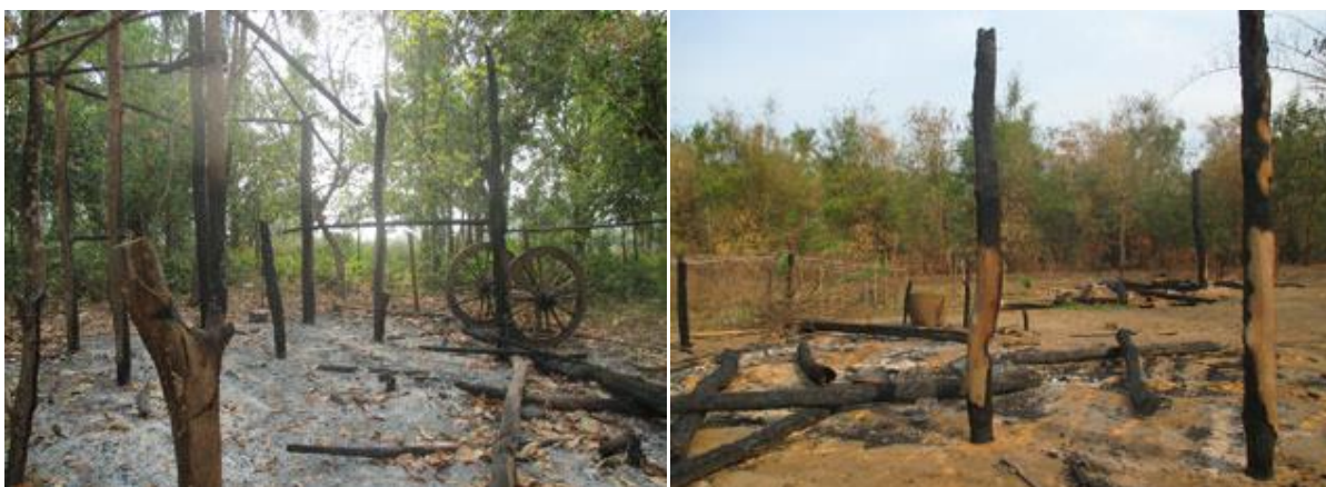
These photos were taken by a KHRG community member in March 2016 in Tha Nay Moo village, Kawkaik Township, Dooplaya District/south Kayin State and show houses burned down by the Tatmadaw and BGF. Reportedly villagers were able to return to their village only after March 2016. 64

There was also fighting between the KNU/KNLA and Tatmadaw in Hpapun District, near the Hatgyi Dam site, on September 30 th 2015 as a result of members of the Tatmadaw entering KNU/KNLA territory, resulting in the torture of one villager by the Tatmadaw and the flight of approximately 10 families to the surrounding Myaing Gyi Nyu Town, Hpa-an District, for safety. 62 More clashes took place between the Tatmadaw, BGF and the DKBA (Buddhist) in January 2016 in Tha Nay Moo village. During that time 16 houses were burned down by the Tatmadaw and BGF. 63