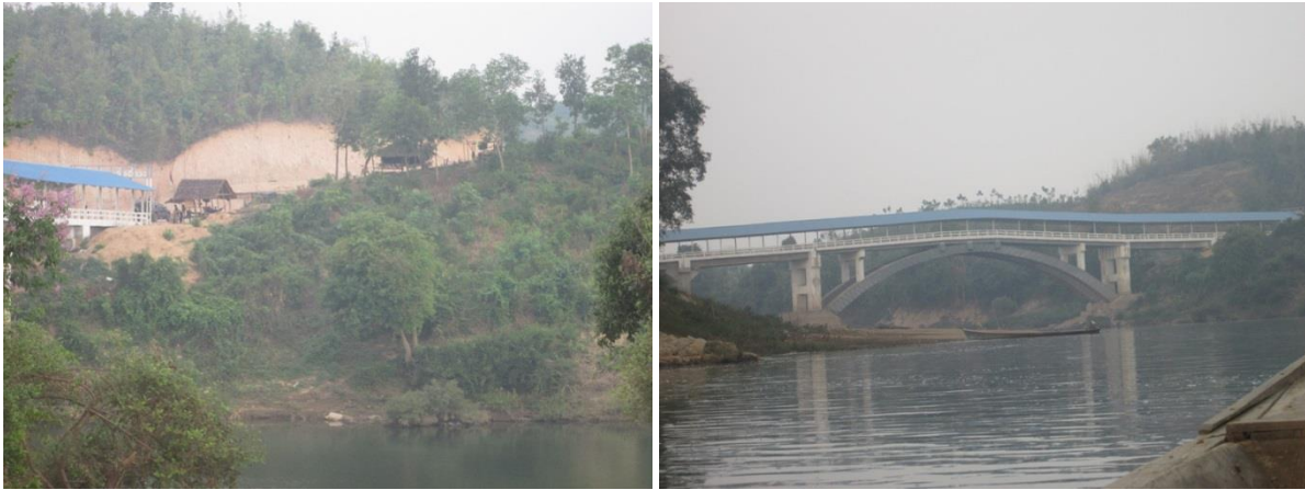
The above photos were taken on May 6 th 2016 at Htee Lah Beh Hta Bridge, Htee Tha Daw Hta village tract, Bu Tho Township, Hpapun District/northeast Kayin State. They show the bridge that was commissioned by Sayadaw U Thuzana and the DKBA (Benevolent) and the checkpoint set up by the Tatmadaw and BGF after the DKBA (Benevolent) left the area. 30

The village tract secretary of another village tract in Lu Thaw Township, Hpapun District, also spoke to KHRG in April 2016 and mentioned that the Tatmadaw are strengthening their bases instead of removing them, as well as sending rations, materials and ammunition: