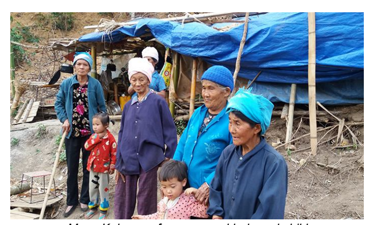
Many Kokang refugees are elderly and children

Our biggest problem here is food. We used to get donations of rice, but we haven't had any for 2 months. We have to try and find work to support ourselves, but it is mostly children and elderly in the camp, so they can't work. We go and find vegetables in the surrounding hills to eat.