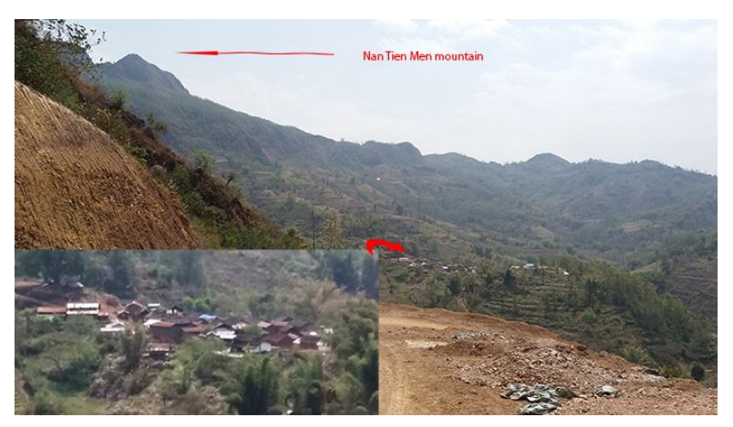
A completely deserted Kokang village (Xiao Lu Chan)

There are now three Burma Army camps set up around our village (Hong Shi Hto). There are about 150 soldiers staying there. There's hardly anyone staying in the village any more. Only a few men sometimes try and go back and farm.