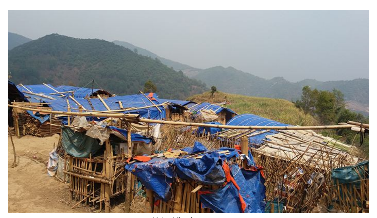
Makeshift refugee camp

Another woman, in her 40s, from a nearby village, Lao Ren Cai, was also raped, in August of last year. She was sheltering in China, but had gone back to check on her house, leaving her husband and children at the border. A group of Burmese soldiers came to her house and raped her. She went crying to the headman and told him what had happened.