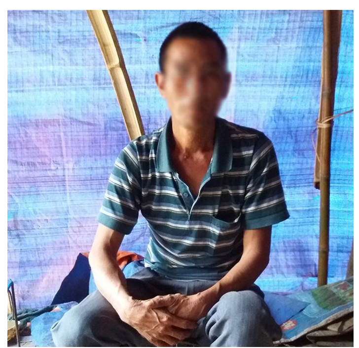
Kokang villager tortured by Burma Army troops

They kept me locked in a room by myself. I was put in leg irons. Every day a couple of soldiers came and asked me: Did you meet Kokang soldiers? Are you a member? Where are the soldiers? Each time I said I knew nothing. Each time, they hit me, sometimes with their fist, and sometimes with a rifle butt. Some days I passed out, and blood poured from my nose.