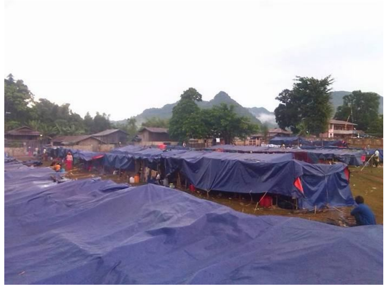
IDP camp at Hai Pa Temple, Mong Hsu township

This attack has caused the entire civilian population of Wan Hai, about 2,000 people, to flee from their homes and seek refuge in nearby villages and towns. Together with ongoing displacement from other areas, this brings the total number displaced by the current offensive to over 6,000. These displaced have had to abandon their homes and farms, and are in dire humanitarian need. 14 schools have been forced to close, with over 1,250 children unable to attend classes. Since November 1, 2015, the Burma Army has blocked all vehicles and people from accessing Hai Pa IDP camp.