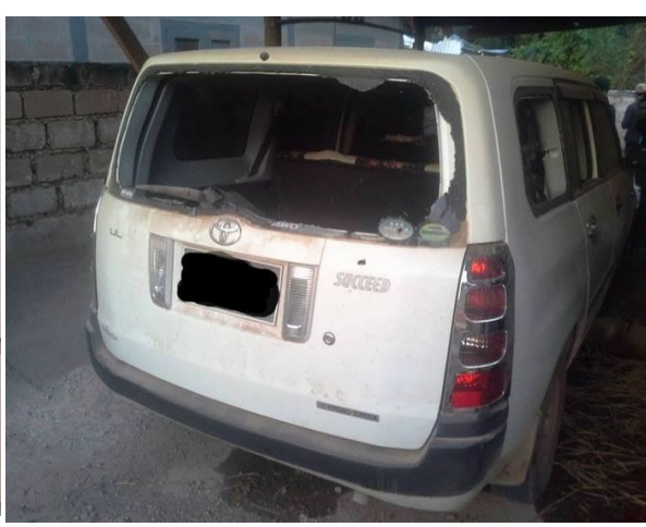
A car which was damaged by Burmese shrapnel