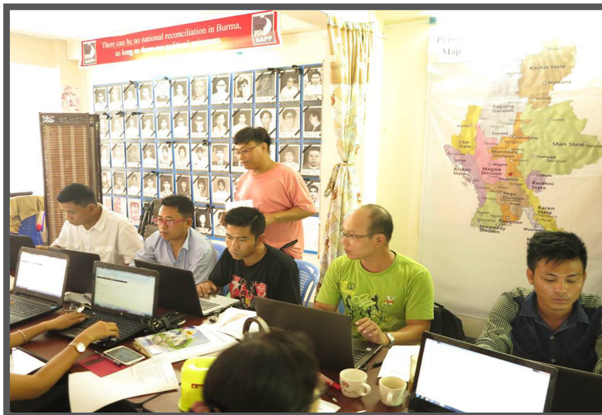
Basic Accounting and Internal Control Training in April