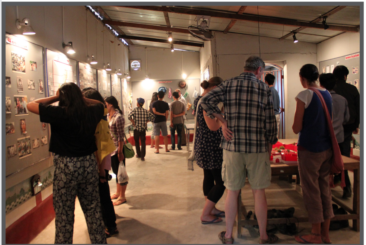
Visitors to the AAPP museum in Mae Sot

In addition to our financial contributors, we would like to thank Former Political Prisoners Society, 88 Generation Peace and Open Society, Human Rights Watch, National League for Democracy, Amnesty International, Project 2049, Burma Campaign UK, US Campaign for Burma, Freedom House, the UN Special Rapporteur, University California Irvine School of Law, The International Centre for Transitional Justice, FIDH and many others inside Burma and around the world for continuing to stand with us in our fight for the unconditional release of all political prisoners. We are indebted to you for your steadfast support and solidarity.