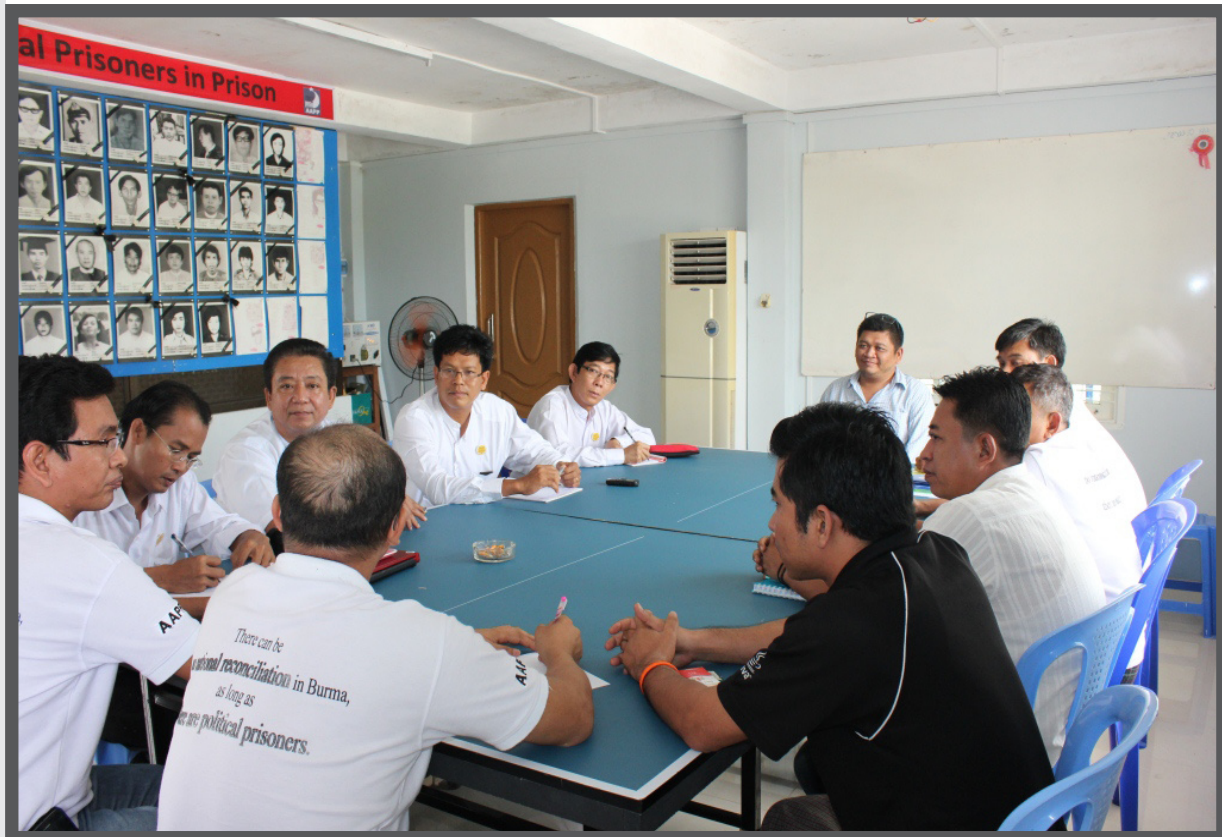
AAPP Members meeting with 88 Generation Peace and Open Society in Rangoon