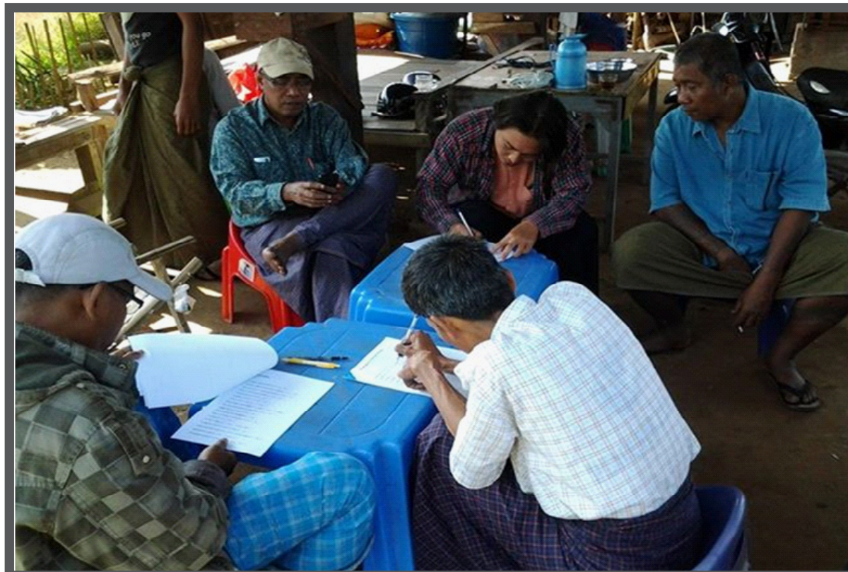
Data Collecting Surveys Completed by Former Political Prisoners

Freedom House conducted a research survey in order to identify common on-going problems facing former political prisoners and their family members. 73 former political prisoners were invited to participate in the survey. The consultation successfully concluded with a collective decision on how to use these findings to work toward an effective advocacy plan.