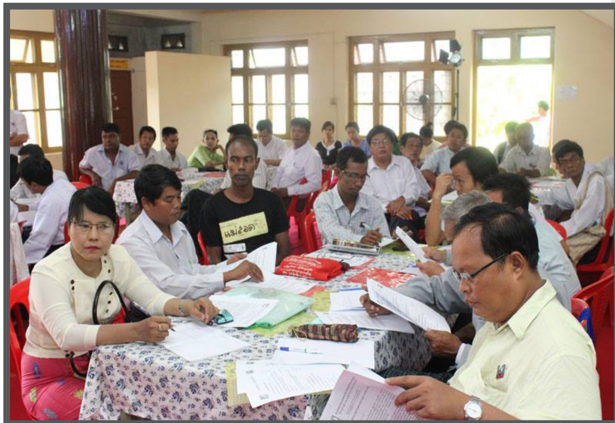
Participants at the two-day workshop in Rangoon in August

In response to the lack of progress made by the CSRPP, from August 17th-18th, AAPP co-hosted a two-day workshop in Rangoon with (FPPS) aiming to define what constitutes a "political prisoner." There were over 50 participants, encompassing representatives from political parties and NGOs, as well as former political prisoners, activists, lawmakers, lawyers and international experts.