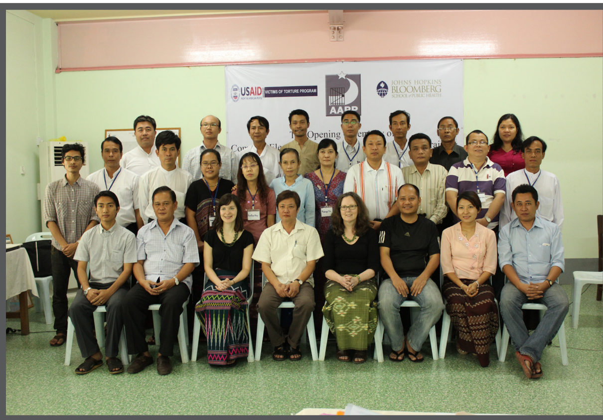
CETA Closing Ceremony

MHAP began using the Common Elements Treatment Approach (CETA), which was developed by Johns Hopkins University (JHU) in order for people affected by trauma, depression and anxiety in low resource countries to be able to receive vital mental health services. CETA is a proven effective method for dealing with mental health issues in conflict areas and has been used, not only to treat people in Burma, but also in other countries with a dearth of mental health services such as Iraq and Thailand.