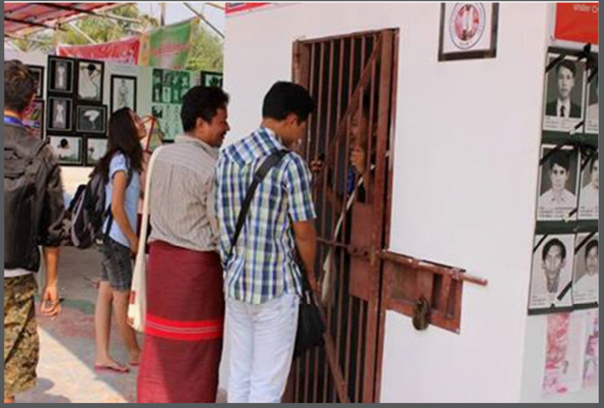
Political Prisoner Exhibition at the Asean People's Forum in March