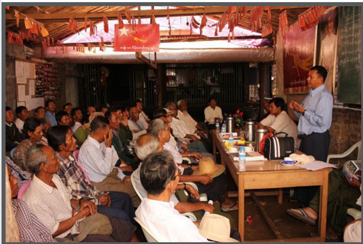
Data Collection in Bogale in February

The following diary demonstrates the ongoing nature of the documentation process: