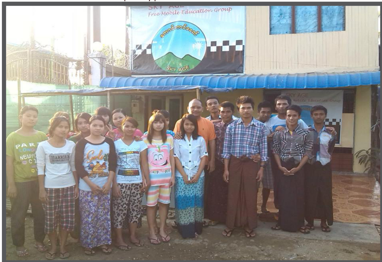
Students at Sky Age School in Rangoon

Educational opportunities and academic support are offered to former political prisoners who may wish to learn new skills or complete their studies. Their unjust imprisonment must not be allowed to impact on their opportunities outside of prison and this area of the assistance program aims to support them in re entering daily life. Provisions are made throughout the year to provide freed political prisoners with the means to continue their education. Academic scholarships and educational funding have been presented to former political prisoners and allow them to achieve academic qualifications or continue an education interrupted by prison.