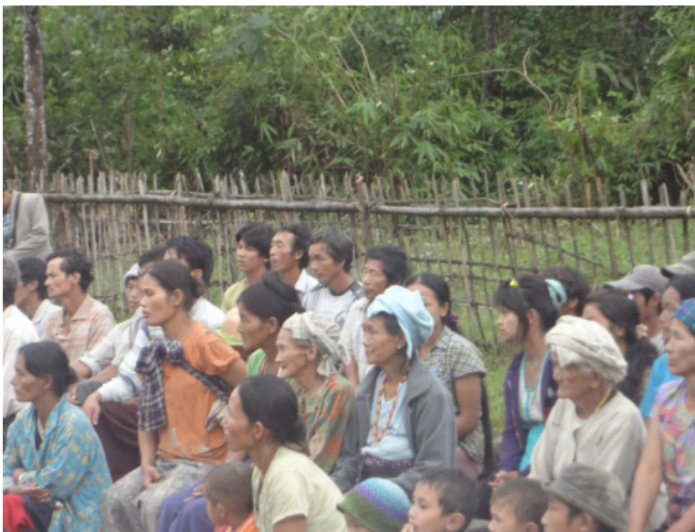
Nhka Ga villagers on 27 September 2013