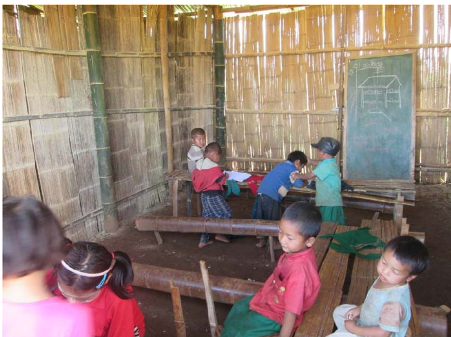
School in Kar Leng Camp

A teacher at the camp said: “I didn’t finish school myself, but I am willing to work as a teacher here because I feel sorry for the children. There is no other school in the village. The villagers just collect money among themselves and support my salary. The conditions are really bad. You can see there are not enough facilities for the children. There are no chairs, no blackboard, chalk, pencils or books.”