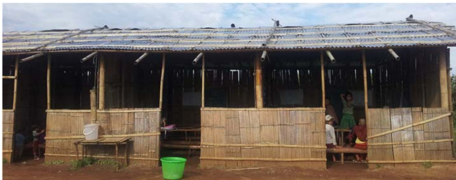
School in Kar Leng camp

In all camps, the children are only accessing primary level education. After primary school most children are leaving school to help their parents earn an income.