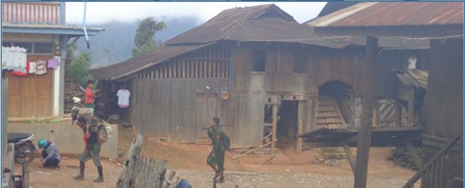
The Burmese soldiers deployed in the village at Palaung areas.