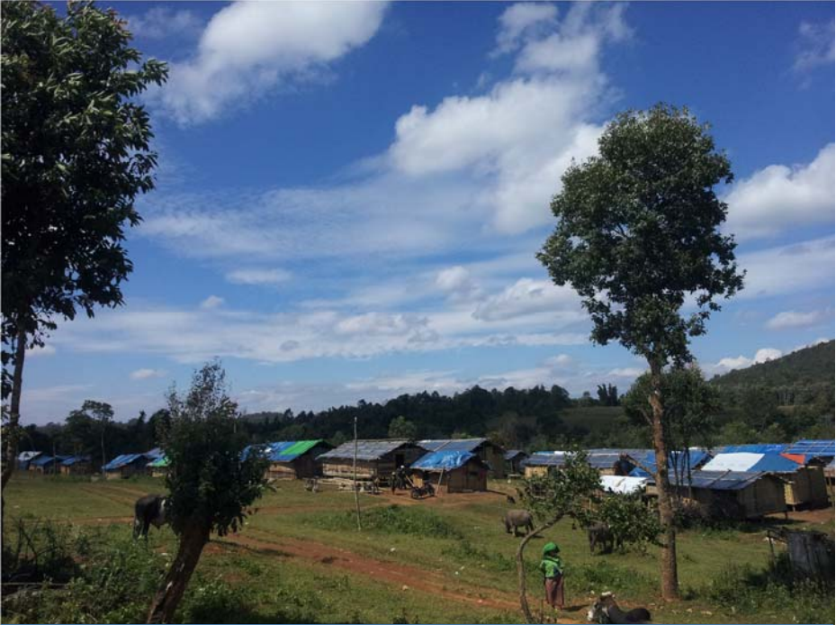
Kar Leng IDPs camp