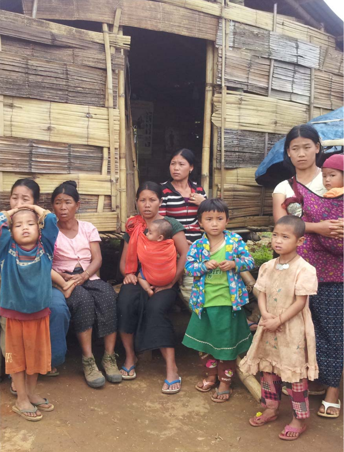
IDPs in camp