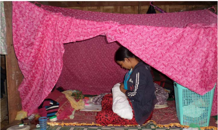
Sick mother with child in IDP camp