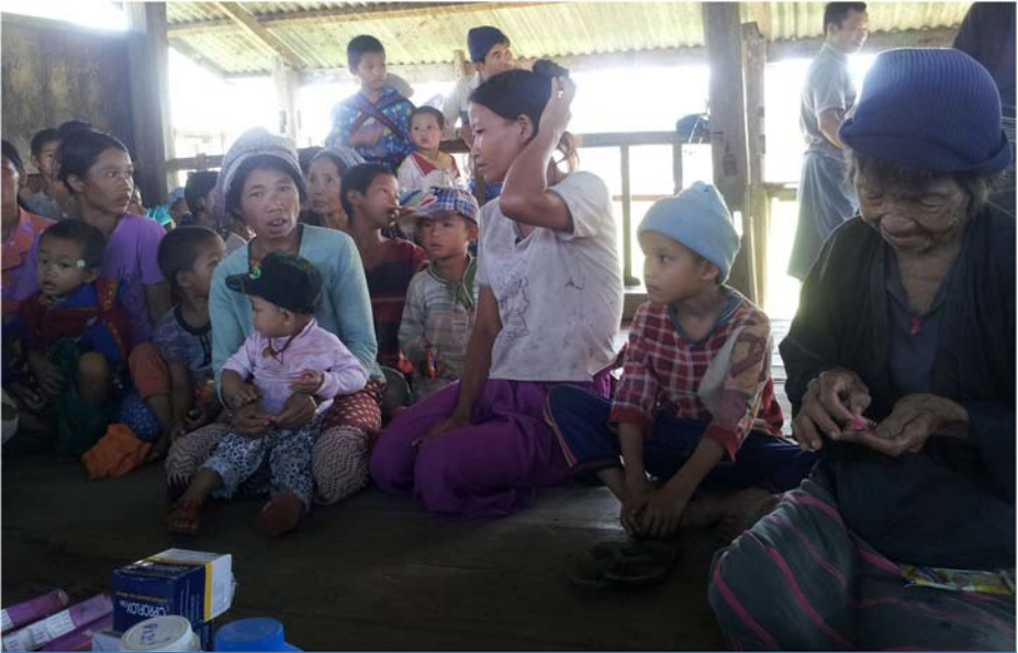
A large number of IDPs face health problem in the camp

had just rubbed pumpkin leaves on it. TWO advised her to visit a hospital, but she said she was too afraid. She continued treating herself but her leg worsened, and TWO learned that she died in November 2013.