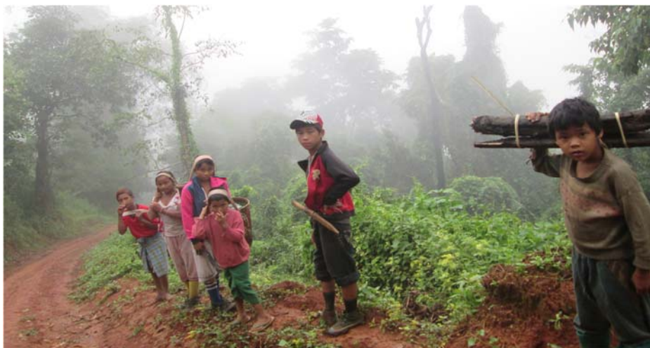
Children help parents for family income

In all camps, the children are only accessing primary level education. After primary school most children are leaving school to help their parents earn an income.