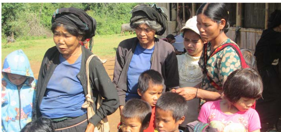
IDP in the Camp

During late 2012 and 2013, the Burma Army launched fresh attacks against Shan, Kachin and Ta'ang forces in the townships of Namtu, Kutkhai and Tangyan. Shelling of villages, destruction of houses and property, forced portering, torture, and sexual violence 2 have caused over 3,000 mainly Palaung villagers in these areas to flee and set up four new camps.