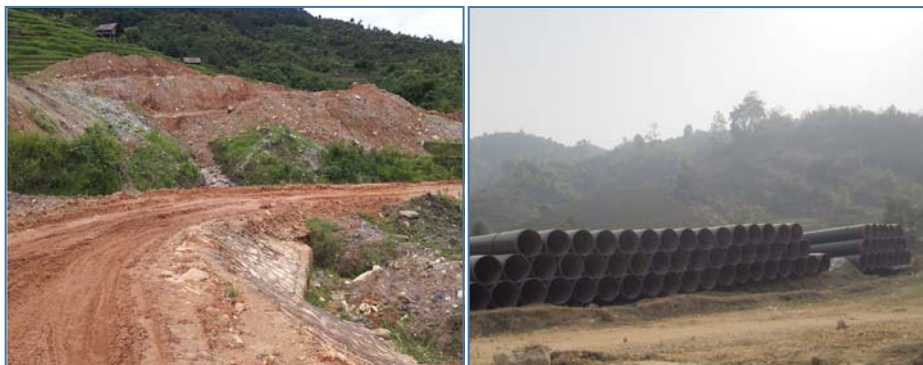
Land confiscation in Palaung areas under Shwe Gas project