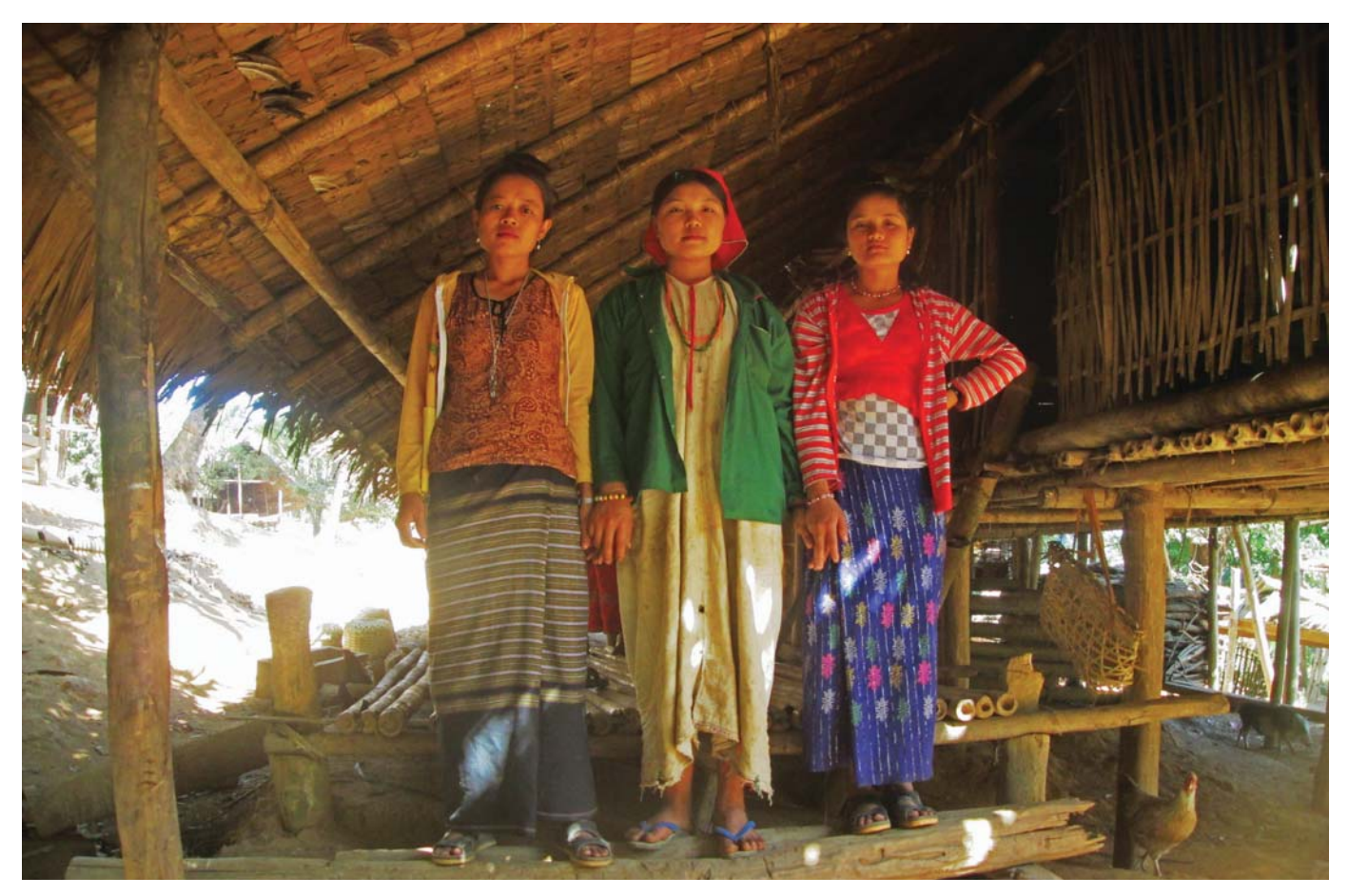
This photo was taken by a KHRG community member on January 23<sup>rd</sup> 2015, in Meh Klaw village tract, Bu Tho Township, Hpapun District. It shows three friends after they had gathered to attend the middle woman's wedding.