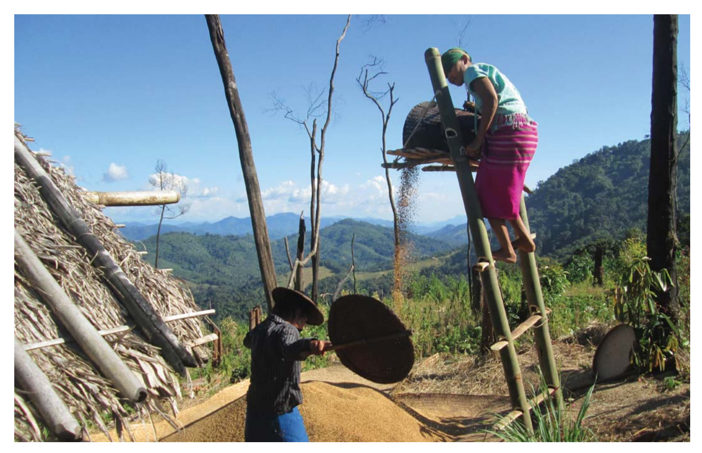
This photo was taken by a KHRG community member on November 13<sup>th</sup> 2014, at a hill farm in H--- village, Daw Poo village tract, Hpapun District. It shows two women winnowing rice, an ancient technique which separates the grain from the chaff