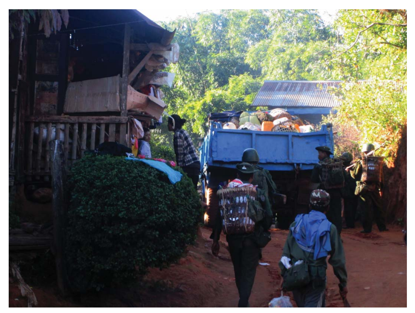
This photo was taken by a KHRG community member on December 1<sup>st</sup> 2014, in J--- village, Htantabin Township, Toungoo District. It shows Tatmadaw soldiers from Military Operations Command (MOC) #5 moving through J--- village during a rotation. The soldiers were transporting rations to their frontline camp in Buh Hsa village.

A number of women reported that they had observed a retreat of women from positions of authority, such as village or village tract leader, in some areas of southeast Myanmar, following the reduction of conflict in the aftermath of the 2012 preliminary ceasefire, and the return of men to villages.