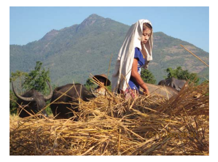
This photo was taken by a KHRG community member on December 6<sup>th</sup> 2012. It shows a girl at a farm near K--- village, Kyaw Pah village tract, Bu Tho Township, Hpapun District. In the foreground are piles of newly harvested rice stalks. The buffaloes in the background are used to trample the piles in order to separate the rice husks from the stalks.