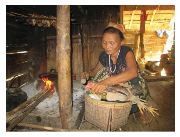
This photo was taken on April 28<sup>th</sup> 2015 in B--village, Meh Klaw village tract, Bu Tho Township, Hpapun District. It shows a villager taking part in a traditional spirit ceremony.

"I also feel bad [upset]. I was thinking to report it but I don't dare to. He will kill me if I do. If I submit the case [to the leaders], would he be okay? If I do submit the case to the leaders, he would tell me he will kill me for ruining his dignity. He would tell me that."