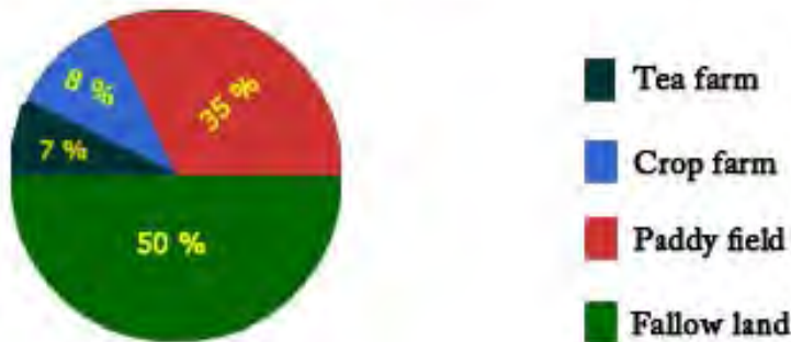
Percentages of the different types of confiscated lands

The Burmese and Chinese governments are discriminating against people in the distribution of compensation to the affected people on the China-Burma Border and in the central part of northern Shan State. Affected people such as Shan, Burmese, Kachin, and others including Chinese people in the Chinese village Nongdao across the Burma-China border are getting ¥ 50,000 per Mu and new land to work on from the Chinese government while those affected local people in northern Shan State only received about 4,461,794 Kyats for the same amount of land. 1 These payments are completely unjust as both sets of affected peoples are suffering from the same projects and the same losses but one is deemed to be more deserving of compensation than the other which is completely unjust and discriminatory.