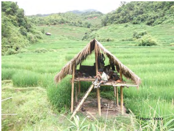
Drug addicts using narcotics in the morning on 16 September 2012 in Nam Kham town, Northern Shan state

Some people in Pan Ta Pyae village, Namtu Township can freely sell heroin and have seized the opportunity to make money due to the fact that the Chinese men have come to work there. In those areas, where the police and soldiers take responsibility for the security of pipeline, they just turn a blind eye to the open sale and use of drugs.