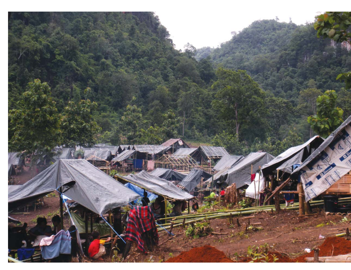
A displaced village in Karen State

This third volume of evidence "Walking Amongst Sharp Knives" builds on the two previous reports. It focuses on the unseen women's leadership role in the armed conflict area and the persecution suffered by Karen women village chiefs. Nearly 100 cases of the persecution of women village chiefs from 1982 until 2009 were documented by the KWO.