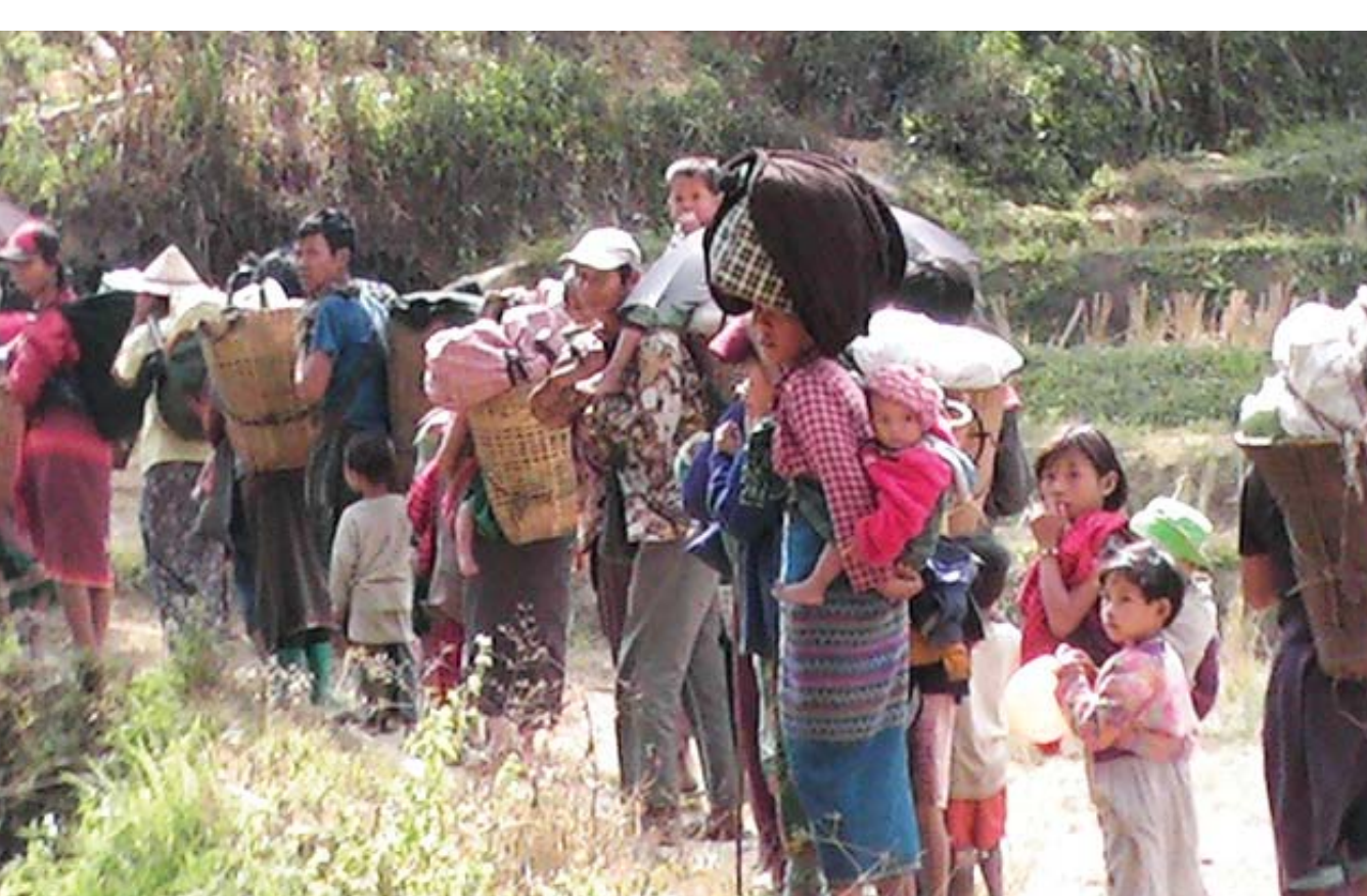
Villagers fleeing fighting in Karen State

"One time when an SPDC soldier was patrolling he started shooting with no direction. A bullet hit one villager. I complained about the incident to the Battalion Commander Officer and for this matter he accused me of being guilty and arrested me. I answered that I was not guilty and if he wanted to kill me regarding my complaining about the incident he could do so. He got angry, captured all the villagers and beat them." (Interview 25)