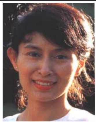
Daw Aung San Suu Kyi

The release of political prisoners is the most important thing for all those who truly wish to bring about change in Burma. We insist that the release of political prisoners is necessary if the process of reconciliation is to go forward to a point where it becomes truly irreversible. 25 Daw Aung San Suu Kyi, General Secretary of the NLD, currently sentenced to 18 months' house arrest under Article 22 of the 1975 State Protection Act. 26