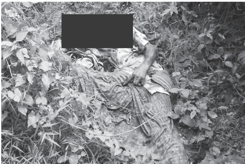
Shan man tortured and killed by Burmese army in Nam San Yang village

The negative effects of torture are not limited to the individual. Family members of the tortured victim must also deal with their loved one's traumatic experience and often feel resentment and mistrust of the authorities responsible. They may also