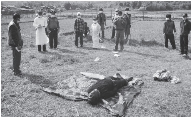
Polices, doctors and villagers came to record the situation of victim tortured by Burmese army and local militia

Torture and ill treatment in ethnic nationality areas does not just take place within