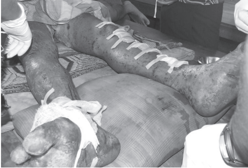
A porter tortured by the government troops in Karen State

which generally takes place in isolated rural areas, especially those in conflict areas, “where the military continues to routinely force civilians into carrying supplies or providing labor for a range of military related duties.” 38 The Burma army has also used prison convicts as porters in armed conflict zones, a practice that has been documented by Human Rights Watch, the Karen Human Rights Group, the United Nations, the International Committee of the Red Cross (ICRC), and Amnesty International. 39 In addition, threats, harassment and violence are often employed by authorities that forcibly recruit laborers, often leading to the use of torture and ill treatment to punish those who are disobedient or too weak to fulfill their duties.