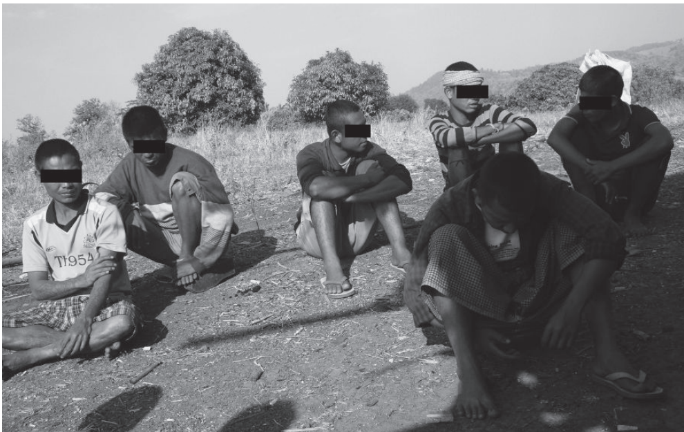
Prisoners forced to be porters that fled post-election day fighting between DKBA and government troops, Karen State 2010

Civilians in ethnic conflict areas who are forced to serve as porters for the Burma Army are generally at the mercy of troops and subjected to multiple forms of torture, both physical and psychological. One form of torture that causes severe